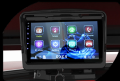
9 inch touchscreen with back-up camera