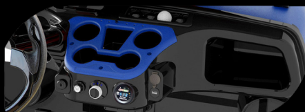
Color matched Dash with four cup holders/cell phone holder