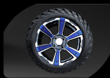
14" Color Matched Silent Tire with Offroad Thread